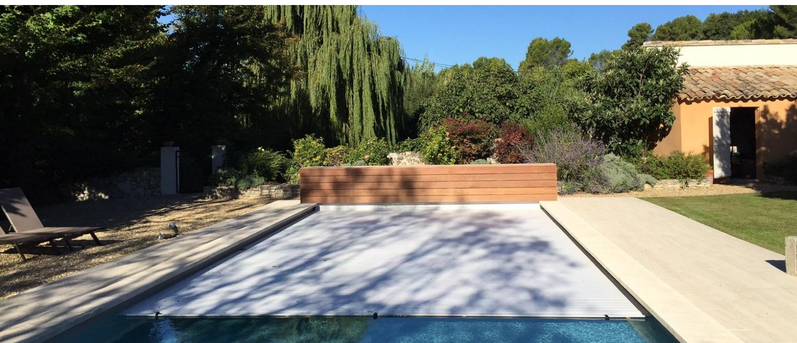
Automatic slat cover for an existing pool

Therefore AquaTop has created several solutions for a top mount system to blend into your area of fun and relaxation.